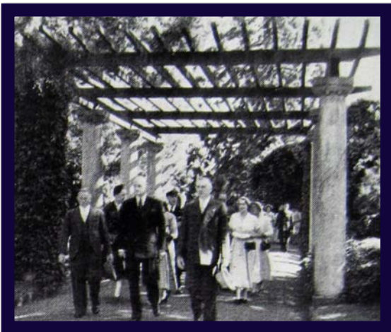
Visitors pass beneath pergola 1955