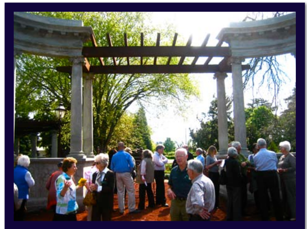
FOBBG. pass beneath pergola 2011